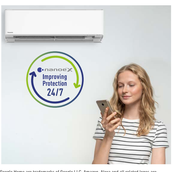
1) 2,5 kW model. 3,5 kW model up to -20 °C. 2) Google, Android, Google Play and Google Home are trademarks of Google LLC. Amazon, Alexa and all related logos are trademarks of Amazon.com, Inc. or its affiliates. Availability of Voice Assistant services varies depending on Country and Language. More information about set up procedures: https://aircon.panasonic.com/connectivity/application.html.